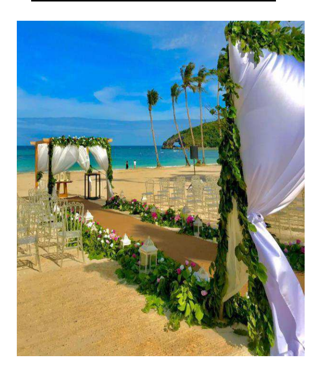
PHP 95,500.00 NET 3 hours use (10 to 49 pax) Processing of Permits for Resort Wedding